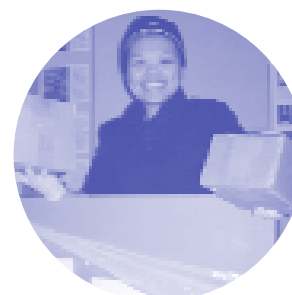
Winners donations for the women