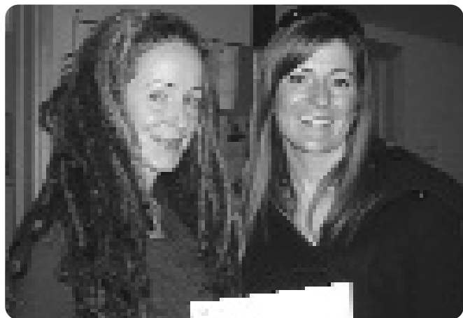
Donation from Bank of Montreal