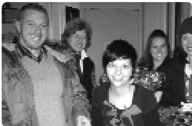
Treats from Time/People Magazine Team

To all our friends who so willingly donated their money, time and effort to ensure that every woman or child at Nellie's had a wonderful holiday season filled with peace, joy and cheer. Happy New Year!