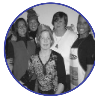
Volunteers from CIBC helping out at the CSO holiday party

So, it's winter again, but that doesn't slow down our events! Instead of outdoor activities, the programs stay indoors. Women from our Her Share program spent time cooking Mexican food in the Ralph Thornton Community Centre Kitchen. Our women also went to a workshop at the Toronto Rape Crisis Centre and shared life stories with the Toronto Play Back Theatre. We were also able to organize an extremely successful fundraising event for United Way Campaign, where staff and women prepared samosas, salads, tandoori chicken, tacos, burritos and more.