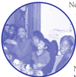
Delicious Christmas dinner

October 31- A Halloween party was held and children, women and staff were dressed in the costumes of their choice. The house was decorated and everyone enjoyed the music, the Halloween movies, the socializing and of course, candies and cakes.