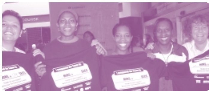
Nellie's staff team at United Way CN Tower Stair Climb, our fastest time was 33 minutes to climb the 1776 steps

In December, the children in the shelter noticed that there was