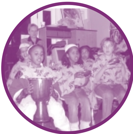
The Wimbawee Singers had an excellent performance

We can look forward to another busy winter here at Nellie's. In January we will celebrate the Lunar New Year and welcome the Year of the Monkey. February will have us grooving at "Jazz it Up" of course, and in March we will celebrate International Women's Day with our sisters in true Nellie's fashion – which means lots of dancing!