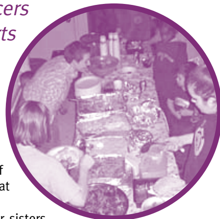
Wonderful holiday supper provided by Riverside Cafe

The Wimbawee singers and the Second Chance dance troupe displayed their remarkable talents. Using traditional African instruments, the Wimbawee singers serenaded the partygoers, and the Try Again dancers donned sparkling t-shirts and showed their rhythmic style.