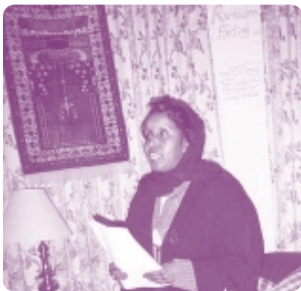
Staff held a celebration of Ramadan in the shelter