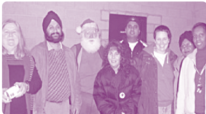
Thank you for the wonderful gifts from Winners and to our Union UNITE for their coordination again this year.

We held a holiday party at the shelter. The delectable feast stretched for miles. We all pulled apart our holiday crackers, wore the bright paper hats, and giggled over the jokes that we found inside. And of course, presents were given to everyone! We were almost too tired to even consider yet another event on New Years Eve, but naturally we did. In the wee hours of the morning, we toasted 2004 together.