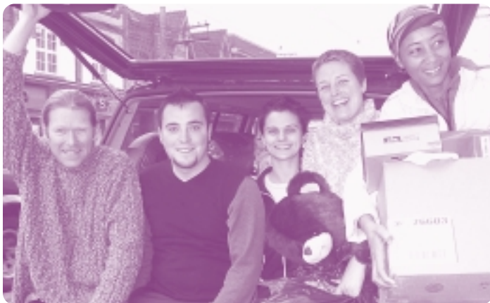
Staff from the Riverside Café collecting a full truck load of toys for Nellie's

Casper came to visit, along with a fashion plate from the 1950s, a guest from a pajama party, a puffy pumpkin and a not-so-wicked witch. We sure didn't worry about our teeth that night as all of our spooky guests joined in for gooey Halloween treats.