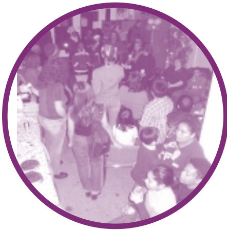
Amazingly packed at the holiday celebration

December was witness to the second annual Festival of Lights celebration at the Community Support Program. The whole room shimmered with the most beautiful glittering lights. The program space was packed with women and children enjoying a turkey dinner with all the fixin's, and holiday cakes in the shapes of trees and gold-and-silver adorned wreaths. Profuse thanks to the Riverside Café who donated this wonderful meal! A special thank you also to Toronto Community Care Access Centre and Montcrest School for their holiday gift drives.