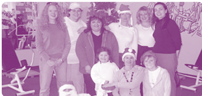
Thanks to the women who joined the Curves Community Challenge to support local charities including Nellie's